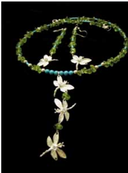
Charms depicted power animals from dragonflies to fish can be worn daily.

sun and the Great Spirit. The mountains point upwards towards the sky, towards spirit. The eagle is the bird that flies closest to the sun. The sun is the bringer of light and life. The sun brings the light from the Great Spirit, and the eagle is in this way the messenger from the Great Spirit.